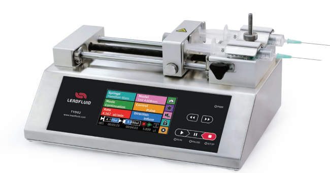
TYD02-02 Syringe: 10µl-140ml